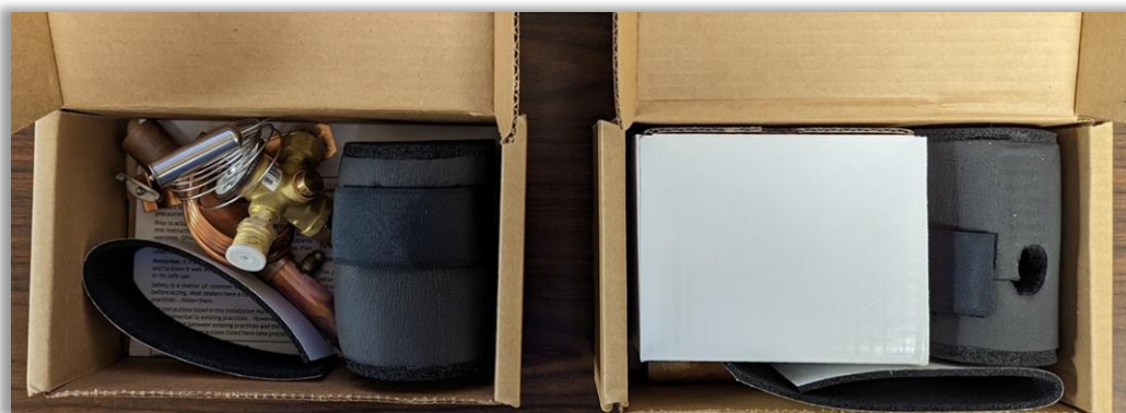
Danfoss Valve Kit

Kits containing Emerson TXV valves contain the proper O-rings and are not affected by this issue. Pictures below show the difference between the two kits.